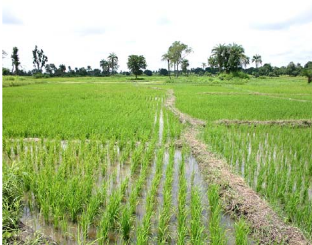
Figure 2. Recommended sawah practice.