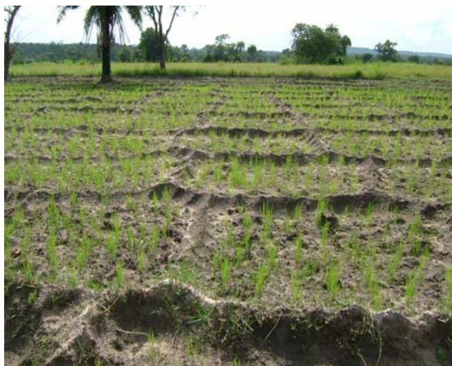
Figure 1. Rudimentary/traditional sawah practice.

Social scientists investigating farmers' adoption behaviour have accumulated considerable evidence showing that demographic variables, technology characteristics, information sources, knowledge, awareness, attitude and group influence affect adoption behaviour. This is predicated on the importance of farmers' adoption of new agricultural technology which has long been of interest to agricultural extensionists and economists.